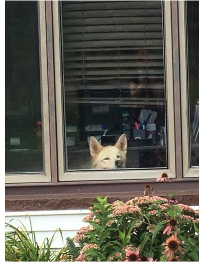
Rayne is still waiting for her forever family.

Applications for the 2017 year will be available on our website in the near future.