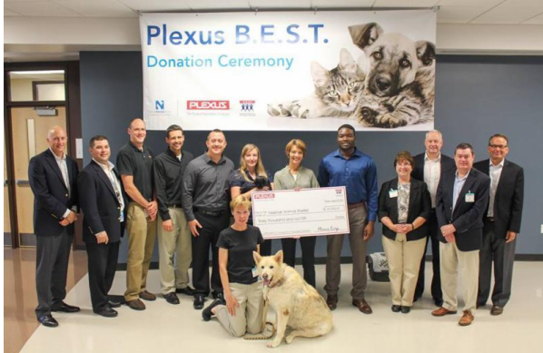
Rayne attended the presentation and is still waiting for her forever home.