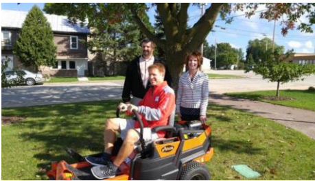
Trying out the new mower.