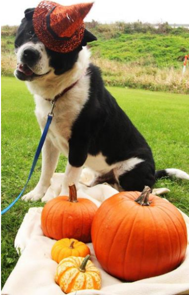
Osiris dressed up and ready for his new family to adopt him.